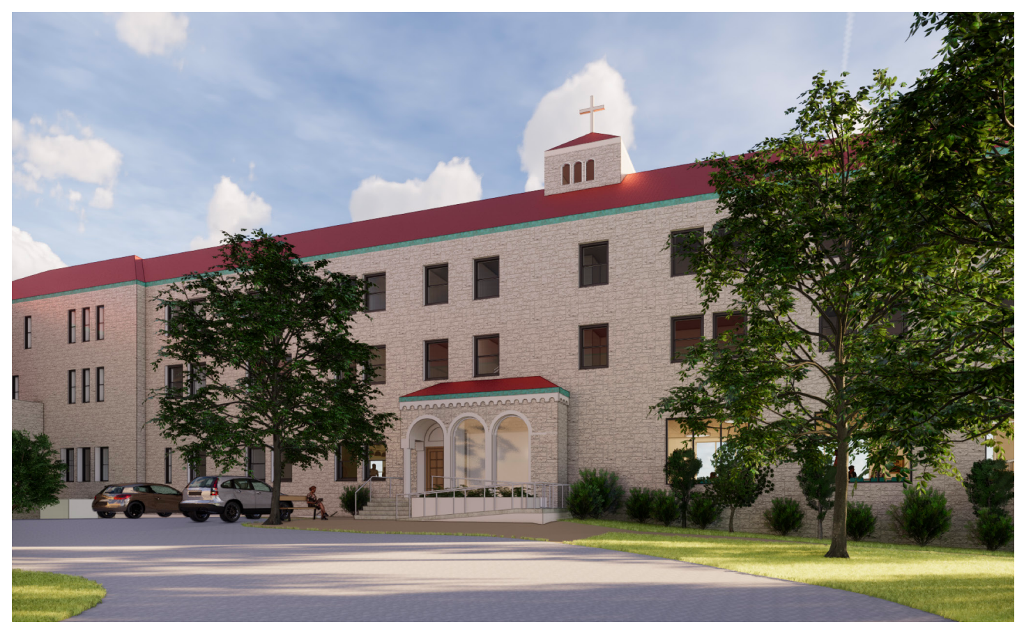
VIEW OF NEW ACCESSIBLE ENTRANCE