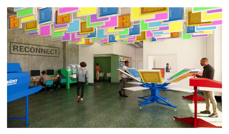
RECONNECT PRESS ROOM